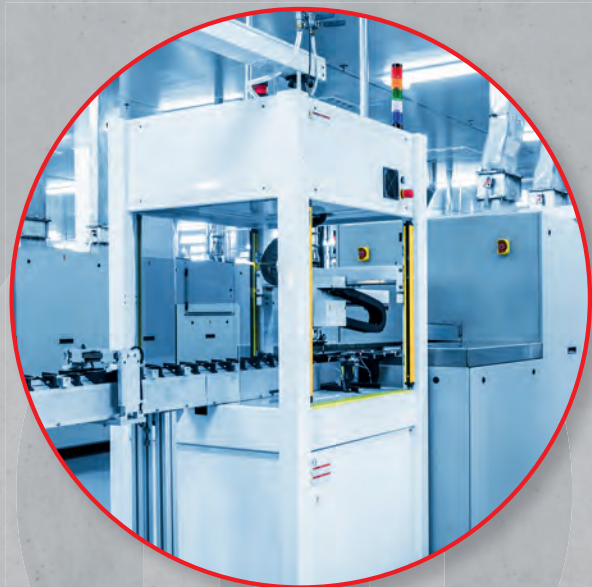
KombiSIGN 40 for equipment manufacturing, smaller machines, shipping and logistics