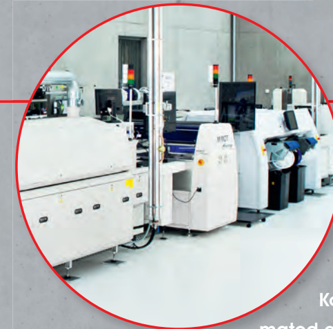
KombiSIGN 72 for machines, auto- mated equipment, shipping and logistics