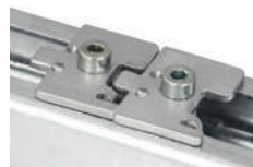
Screw-foot loose, for 30 mm DIN-rail shape C (width of mouth: 16 – 17 mm) with twist protection notch PU: 10, Order No. 36231

SC-foot: space-saving design enables high cable density. Mounting foot adjusts itself when tightening the screw.